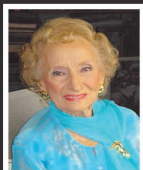
RUTH GRUBER U.S. RESCUER (DOCUMENTARY EXCERPT)