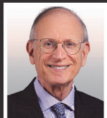
STUART E. EIZENSTAT SPECIAL ADVISOR TO THE SECRETARY OF STATE ON HOLOCAUST ISSUES MODERATOR